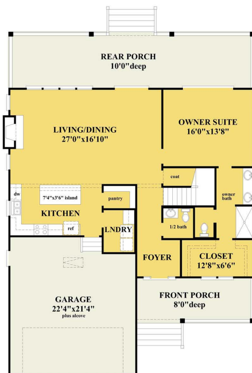
FIRST FLOOR PLAN 1354 HEATED SQUARE FEET

This house plan offers an open floor plan, kitchen with large walk-in pantry and nice sized owner's suite all in a smaller footprint. The second floor features two bedrooms and two areas for walk-in attic space.