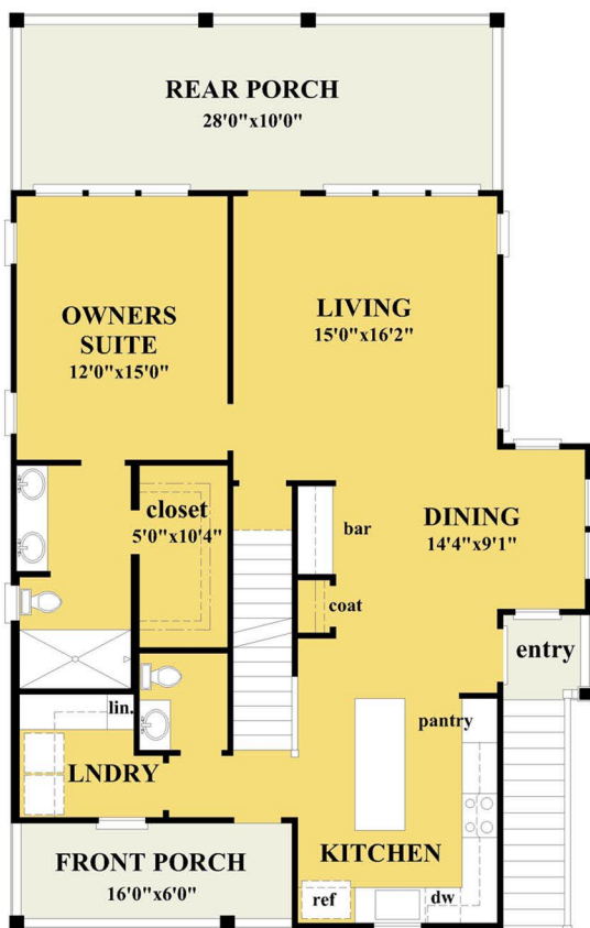
FIRST FLOOR PLAN 1129 HEATED SQUARE FEET

Avon is a great coastal small house plan with rear oriented views featuring an open floor plan and main level owner's suite.