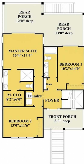
FIRST FLOOR PLAN 1035 HEATED SF

Marberry Wynd offer a reverse floor plan in a compact 32' wide footprint. Open floor plans and large rear porches on both the second and third floor take advantage of views.