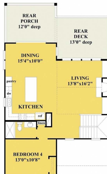
SECOND FLOOR PLAN 976 HEATED SF